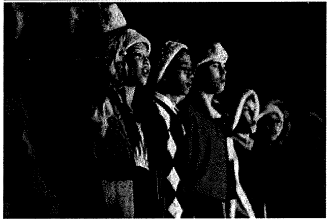
20th Anniversary of Ethel M's Cactus Lighting